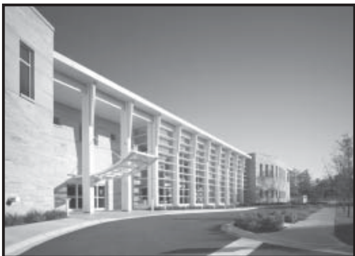
The new library opened at 125 S. Prospect Ave. on Oct. 4, 2003.