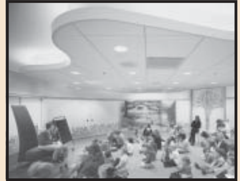
The new library's Storytime Room