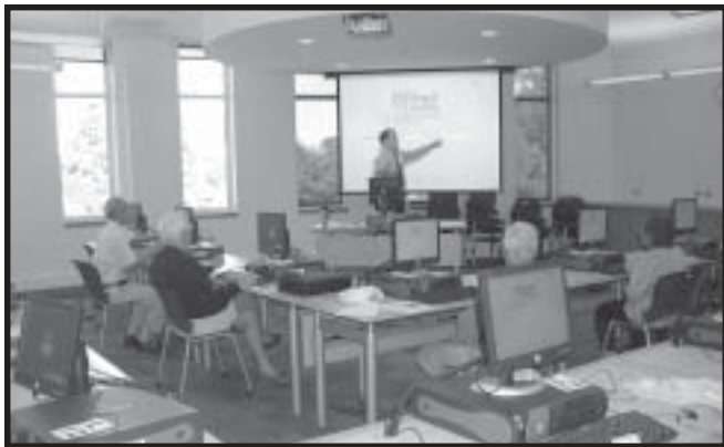
More than 240 students attended hands-on computer classes in the new computer lab from January through April 2004.